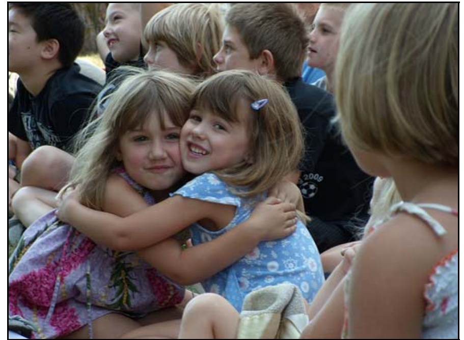
Summer Reading Program, 2009

We promote lifelong learning in our community by providing books, programs, and technology